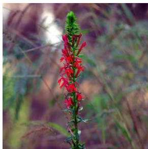
Cardinal Flower Lobelia cardinalis

Sun Needs: Part Sun/Shade Water Needs: Moist to Wet Bloom Time: Summer Bloom Color: Red