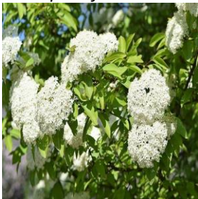
Blackhaw Viburnum Viburnum prunifolium

Light Needs: Part Sun Water Needs: Medium Bloom Season: Spring Bloom Color: White Mature Height: 6-12' Growth Rate: Slow/Moderate