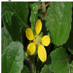
Green and Gold Chrysogonum virginianum

Light Needs: Part Sun Water Needs: Medium to Moist Bloom Season: Spring through Summer Bloom Color: Yellow