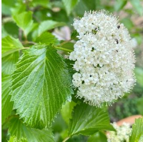
Arrowwood Viburnum Viburnum dentatum

Light Needs: Full/Part Sun Water Needs: Medium Bloom Season: Spring Bloom Color: White Mature Height: 6-12' Growth Rate: Moderate