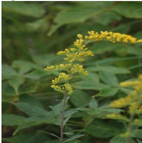
Gray or Dwarf Goldenrod Solidago nemoralis

Light Needs: Full/Part Sun Water Needs: Dry Bloom Season: Summer/Fall Bloom Color: Yellow