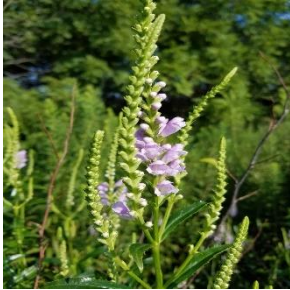
Obedient Plant Physostegia virginiana

Sun Needs: Full Sun Water Needs: Medium Bloom Season: Summer Bloom Color: Pink or White