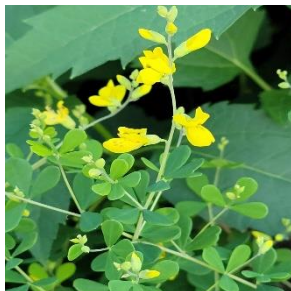
Wild Yellow Indigo Baptisia tinctoria

Light Needs: Full Sun/Part Sun Water Needs: Dry to Medium Bloom Season: Summer Bloom Color: Yellow