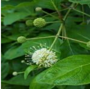
Buttonbush Cephalanthus occidentalis

Light Needs: Part Sun/Shade Water Needs: Moist/Wet Bloom Season: Summer/Fall Bloom Color: White Mature Height: 6-12' Growth Rate: Fast