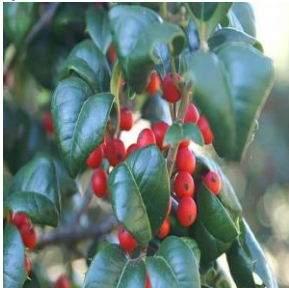
American Holly Ilex opaca

Light Needs: Full/Part Sun Water Needs: Moist Bloom Season: N/A Bloom Color: N/A Mature Size: 30-50' Growth Rate: Slow/Moderate