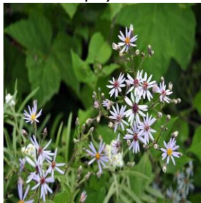
Big-leaved Aster Eurybia macrophyllus

Light Needs: Full Sun/Shade Water Needs: Dry to Moist Bloom Season: Late Summer to Early Fall Bloom Color: White/Purple/Blue