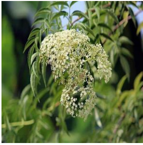
American Elderberry Sambucus canadensis

Light Needs: Part Sun Water Needs: Moist/Wet Bloom Season: Summer Bloom Color: White Mature Height: 6-12' Growth Rate: Moderate