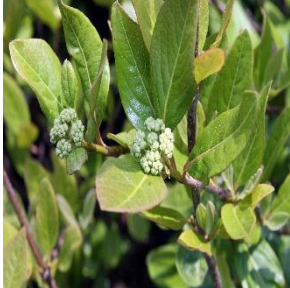
Winterthur Viburnum Viburnum nudum 'Winterthur'

Light Needs: Full/Part Sun Water Needs: Medium/Wet Bloom Season: Spring Bloom Color: White Mature Height: 6-12' Growth Rate: Moderate