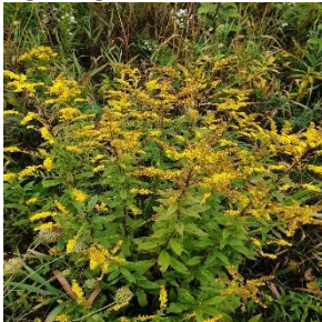
Rough-Leaved Goldenrod Solidago rugosa

Light Needs: Full Sun/Part Sun Water Needs: Moist/Wet Bloom Season: Summer/Fall Bloom Color: Yellow