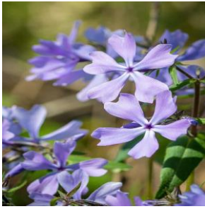
Wild Blue Phlox Phlox divaricate

Light Needs: Part Sun/Shade Water Needs: Medium/Moist Bloom Season: Spring Bloom Color: Blue