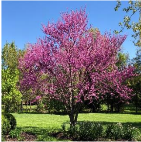
Eastern Redbud Cercis canadensis

Light Needs: Part Sun/Shade Water Needs: Medium Bloom Season: Spring Bloom Color: Purple Mature Size: 12-36' Growth Rate: Moderate/Fast