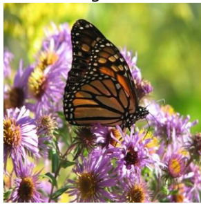
New England Aster Aster novae-angliae

Sun Needs: Full/Part Sun Water Needs: Medium/Moist Bloom Season: Summer/Fall Bloom Color: Purple, Pink, or White