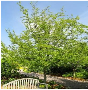
American Hornbeam Carpinus caroliniana

Light Needs: Full/Part Sun/Shade Water Needs: Moist/Wet Bloom Season: N/A Bloom Color: N/A Mature Height: 30-50' Growth Rate: Slow