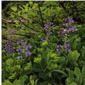
Blue False Indigo Baptisia australis

Light Needs: Full/Part Sun Water Needs: Medium Bloom Season: Spring Bloom Color: Purple/Blue